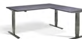
ANTHRACITE SHERMAN OAK Raw Frame

1600x1600: FORC/16001600WEN 1800x1600: FORC/18001600WEN