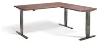
FERRO BRONZE Raw Frame

1600x1600: FORC/16001600CON 1800x1600: FORC/18001600CON