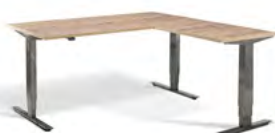
TIMBER Raw Frame

1600x1600: FORC/16001600NDW 1800x1600: FORC/18001600NDW