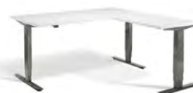
WHITE Raw Frame

1600x1600: FORC/16001600GRY 1800x1600: FORC/18001600GRY