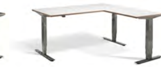
WHITE PLY EDGE Raw Frame

1600x1600: FORC/16001600GRA/PE 1800x1600: FORC/18001600GRA/PE