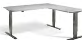
GREY Raw Frame

1600x1600: FORC/16001600GRA 1800x1600: FORC/18001600GRA