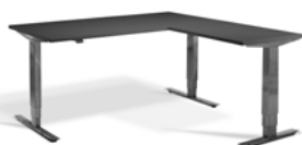
GRAPHITE Raw Frame

1600x1600: FORC/16001600BLA 1800x1600: FORC/18001600BLA