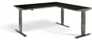
BLACK PLY EDGE Raw Frame

1600x1600: FORC/16001600CAS 1800x1600: FORC/18001600CAS