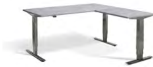
CONCRETE Raw Frame

1600x1600: FORC/16001600WHI/PE 1800x1600: FORC/18001600WHI/PE