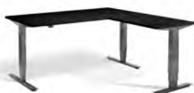
BLACK Raw Frame

1600x1600: FORC/16001600BLA 1800x1600: FORC/18001600BLA