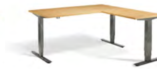
OAK Raw Frame

1600x1600: FORC/16001600BEE 1800x1600: FORC/18001600BEE