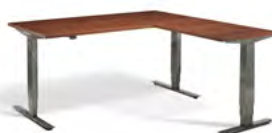
NATURAL DIJON WALNUT Raw Frame

1600x1600: FORC/16001600ASO 1800x1600: FORC/18001600ASO