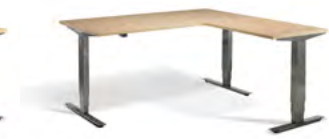
MAPLE Raw Frame

1600x1600: FORC/16001600OAK 1800x1600: FORC/18001600OAK