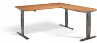
BEECH Raw Frame

1600x1600: FORC/16001600GNO 1800x1600: FORC/18001600GNO