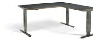
GRAPHITE PLY EDGE Raw Frame

1600x1600: FORC/16001600BLA/PE 1800x1600: FORC/18001600BLA/PE