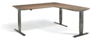
GREY NEBRASKA OAK Raw Frame

1600x1600: FORC/16001600GNO 1800x1600: FORC/18001600GNO