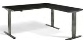
WENGE Raw Frame

1600x1600: FORC/16001600WHI 1800x1600: FORC/18001600WHI