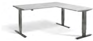
CASCINA PINE Raw Frame

1600x1600: FORC/16001600MAP 1800x1600: FORC/18001600MAP