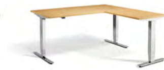
OAK Chrome Frame

1600x1600: CRMC/16001600BEE 1800x1600: CRMC/18001800BEE