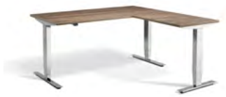
GREY NEBRASKA OAK Chrome Frame

1600x1600: CRMC/16001600GNO 1800x1600: CRMC/18001800GNO