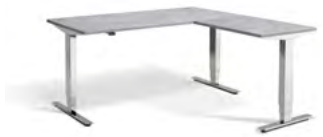
CONCRETE Chrome Frame

1600x1600: CRMC/16001600WHI/PE 1800x1600: CRMC/18001800WHI/PE