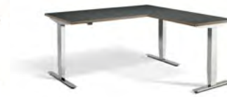
GRAPHITE PLY EDGE Chrome Frame

1600x1600: CRMC/16001600BLA/PE 1800x1600: CRMC/18001800BLA/PE