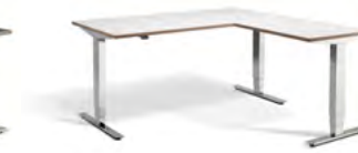
WHITE PLY EDGE Chrome Frame

1600x1600: CRMC/16001600GRA/PE 1800x1600: CRMC/18001800GRA/PE