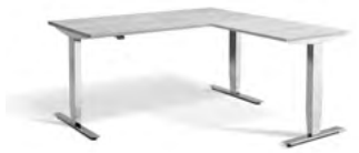
CASCINA PINE Chrome Frame

1600x1600: CRMC/16001600MAP 1800x1600: CRMC/18001800MAP